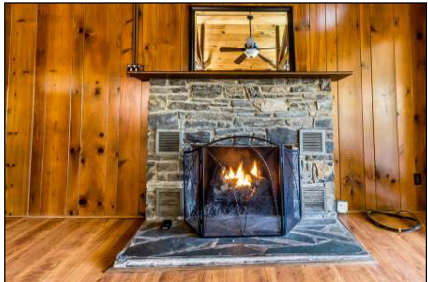
The field stone fireplace features gas logs, a cozy spots for cool days.