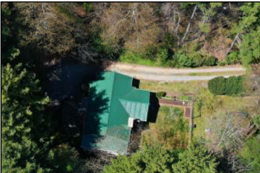
149 Wild Rose offers exceptional privacy, both from inside the home and also in the yard.