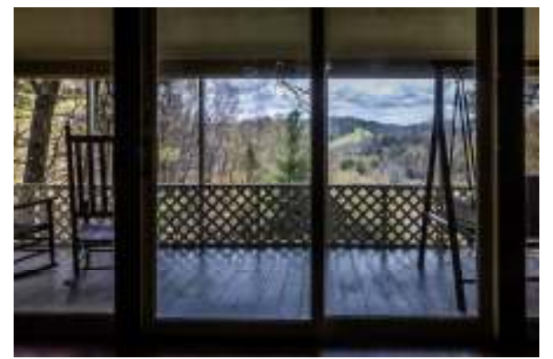
View from Inside the Cabin

149 Wild Rose offers you two benefits not often found together in Boone: a five minute drive to Boone located on an exceptionally private half acre. PLUS: a lovely pastoral view