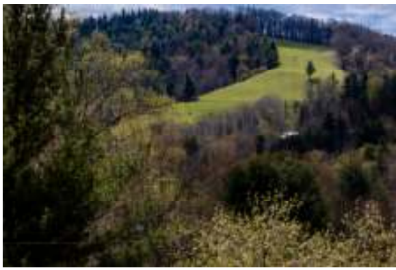
Pastoral, Wooded View